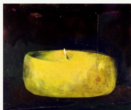
CANDLE BY BERINA KOKONA

According to the Decision of Council of Minister no.414, dated 27.06. 2012 “On some amendments in the Decision of Council of Ministers no.1114, dated 30.07.2008 “On some issues for the implementation of the law no.7703, dated 11. 5.1993 “On social security in the Republic of Albania”, as amended, and law no.9136, dated 11.9.2003 “On the collection of the mandatory contributions of social security and health insurance in the Republic of Albania”, as amended, and law no.7870, dated 13.10.1994 “On health insurance in the Republic of Albania”, the minimum monthly salary for the purposes of the calculation of social security and health insurance contributions is now 18,295.00 Leke (approximately 133 Euro) whereas the maximum salary is 91,475.00 Leke (approximately 666 Euro) .